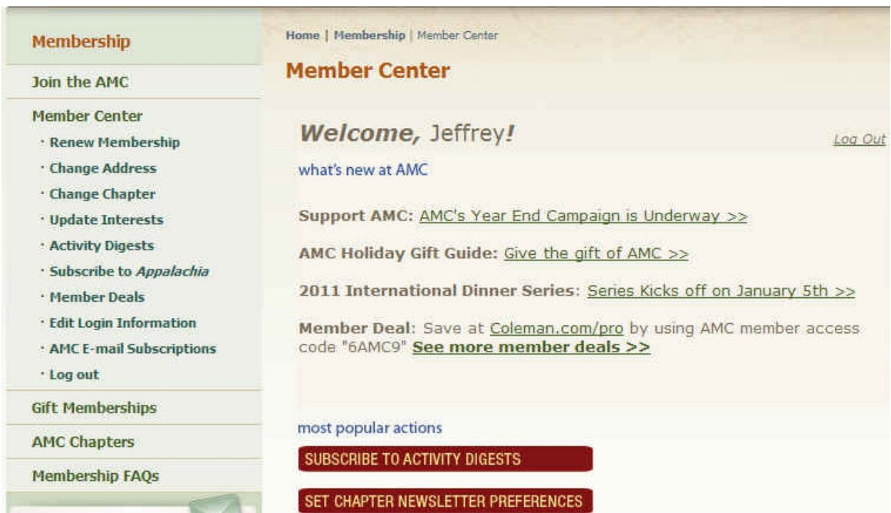
Step 6 – Selecting Electronic Delivery of Chapter Newsletter

After successfully logging into the Member Center, part of the page will look something like this. There are a number of things you can do here but to select electronic delivery of the newsletter, click the “Set Chapter Newsletter Preferences” button.