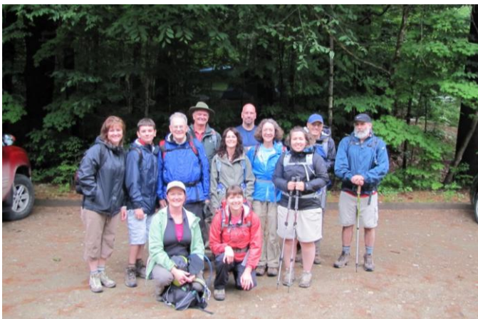
Vermont Hiking Weekend, June 2011

Visit www.outdoors.org/photocontest for full rules and entry instructions. Entries will be accepted until November 15; winners will appear in a spring 2012 issue of AMC Outdoors .