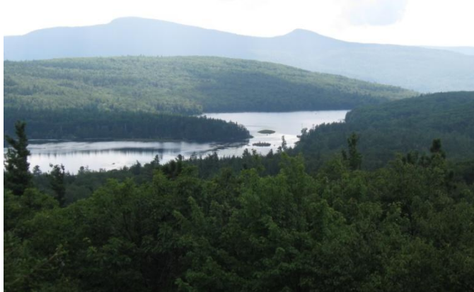
View of North and South Lakes from Sunset Rock

A day-long hiking and picnicking outing was held at North Lake Public Campground & Pavilion on Saturday, August 20, 2011. Chapter members and their guests began arriving at 9 A.M. The weather could not have been better for activities that included hikes to Boulder Rock, Sunset Rock, Catskill Mountain House Site, Newman's Ledge, and around the campground.