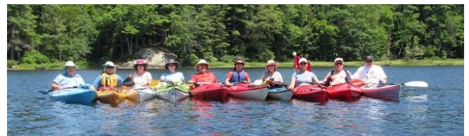
A good year for paddles: W. Branch Sacandaga River, July 2011