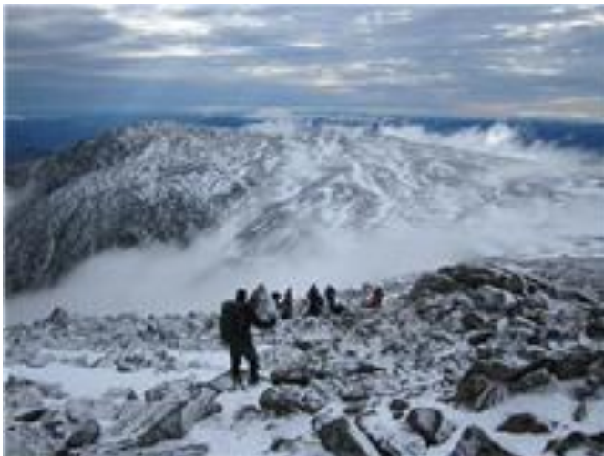
Gearing Up Before the Final Push by Tracie A. Henry, New Hampshire Chapter. 2010 AMC Photo Contest winner in the "AMC in Action" category.

AMC's 17 th annual photo contest is now open to all members, with more prizes than ever up for grabs. This year's Grand Prize winner will receive a spot in an upcoming photography workshop and an accompanying stay at an AMC destination.