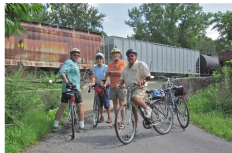
Mohawk Hudson Bike Path, August 2011

image to like our page: if you have a facebook account, you'll be asked to log in. Otherwise, you will have to set one up in order to "like" our page.