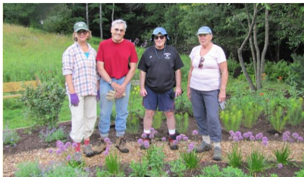
August 2018 Dyken Pond Environmental Center