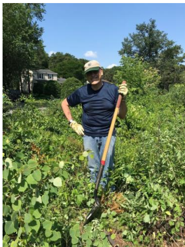
July 2018 Citizen Science – Invasive Plant Removal at Pine Bush Preserve