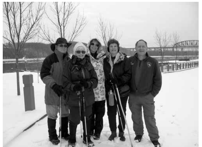
Schodack Island State Park, January 2010

J oin members from other AMC chapters at the Mohican Outdoor Center Friday – Sunday, April 30-May 2. The Mohican Outdoor Center is located in western New Jersey near the Delaware Water Gap. Hiking, biking, paddling, Irish dancing are among the planned activities. Accommodations include multi bed cabins and tenting. For more information go to AMC's website, http://www.outdoors.org/lodging/lodges/mohican/spring-fling-2010.cfm .